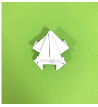
20. Turn your toad over and push it's back/bum down to make it hop!