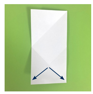
7. Fold all corners back out again.