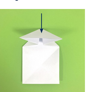
9. Fold the top down to make an arrowhead.