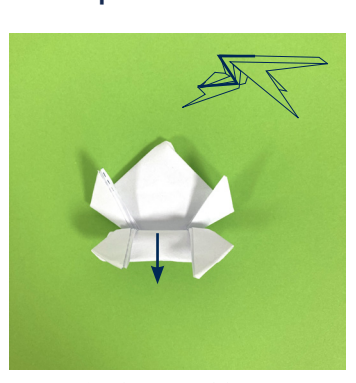
19. Fold the bottom legs down on themselves to make a 'z' from the side.