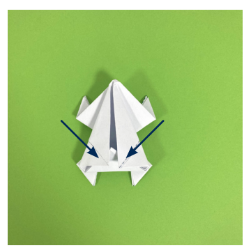
16. Fold both side corners in to meet the bottom of it's back.