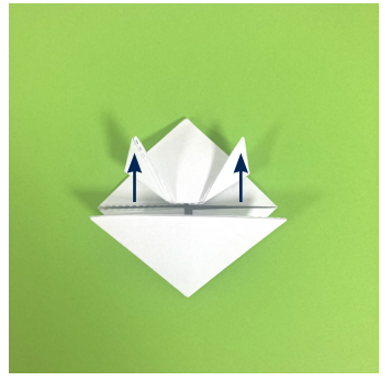
12. Fold the two top arrowhead corners up to make legs.