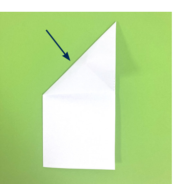
5. Fold the top Left corners in to meet the edge and back out.