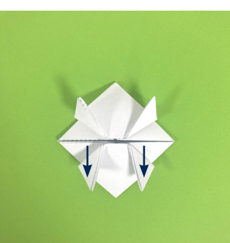
13. Do the same with the bottom arrowhead corners.