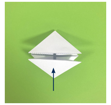
11. Fold the bottom up to make another arrowhead.

Continue the steps on this page to finish your origami toad.