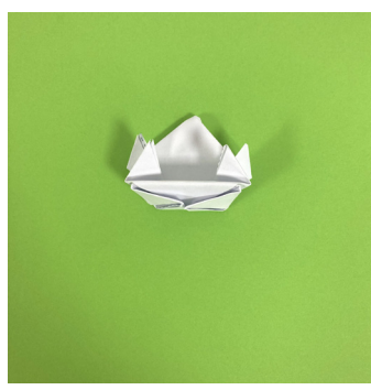
18. Turn your toad over.