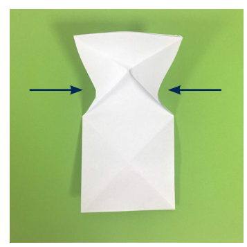
8. Pinch the top sides into the middle.