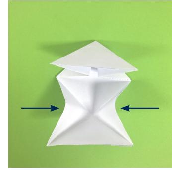
10. Pinch the bottom sides into the middle.