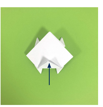
15. Fold the bottom corner of the toad's back up to the middle.