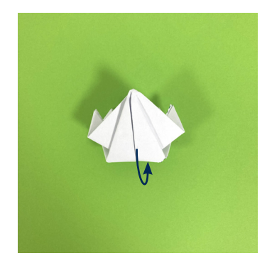
17. Fold the toad's back legs and bum under it's front legs.