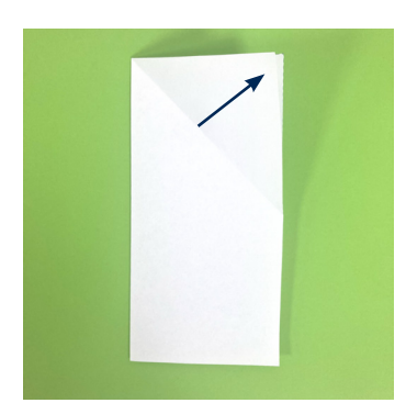
4. Fold the corner back out again.