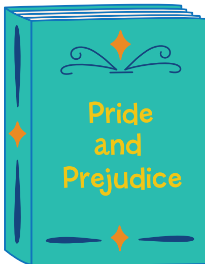
Pride and Prejudice (1813)