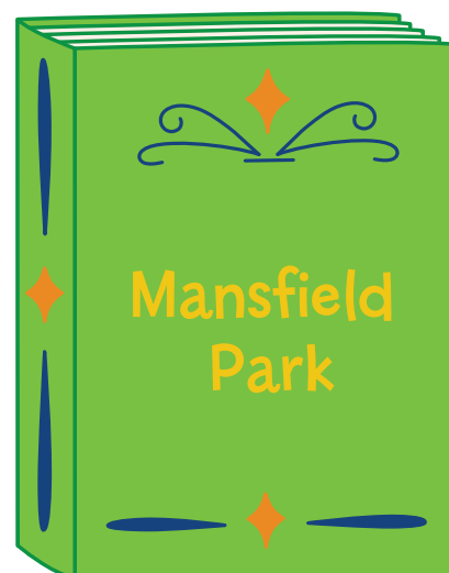
Mansfield Park (1814)