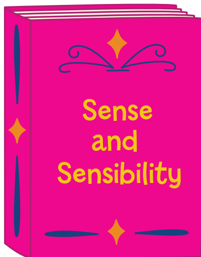
Sense and Sensibility (1811)

How well do you know Jane Austen's classic novels? Match each quote on page 2 to the correct Jane Austen book. For an extension, why not try matching which character from that book said the quote?